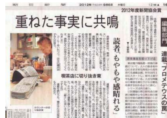
"Promethean Trap" column, September 6, 2012

Under Yorimitsu, the section's crowning achievement was an investigative series called Purometeusu no Wana , or "The Promethean Trap," a play on the atomic industry's early promise of becoming a second fire from heaven like the one stolen by Prometheus in Greek mythology. The series, which appeared daily starting in October 2011, won The Japan Newspaper Publishers and Editors Association Prize, Japan's equivalent of the Pulitzer Prize, in 2012 for its reporting on provocative topics like a gag-order placed on scientists after the nuclear accident, and the government's failure to release information about radiation to evacuating residents. The series also spawned some larger investigative spin-offs, including an exposé of corner-cutting in Japan's multi-billion dollar radiation cleanup that won the prize for a second time in 2013.