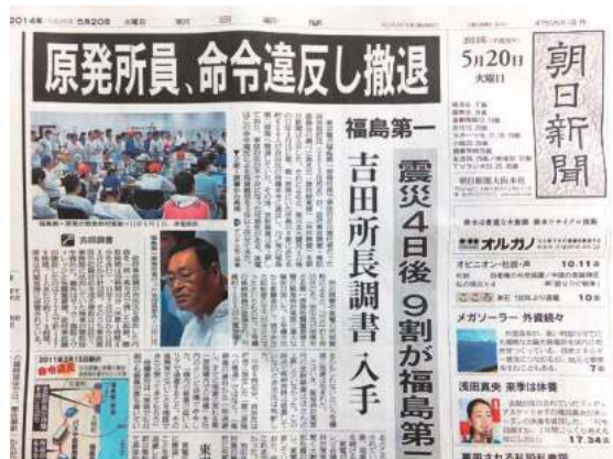
Top Page of Asahi Shimbun on May 20, 2014

They may have been able to do so if the Asahi had not given its opponents not just one but two openings to strike.