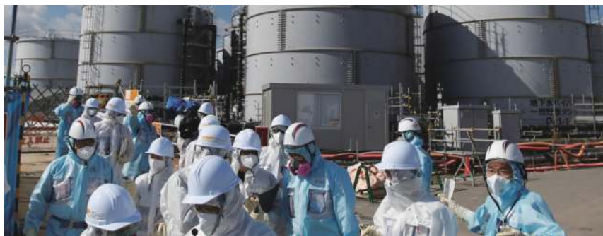
Reporters touring the Fukushima plant, February 2016